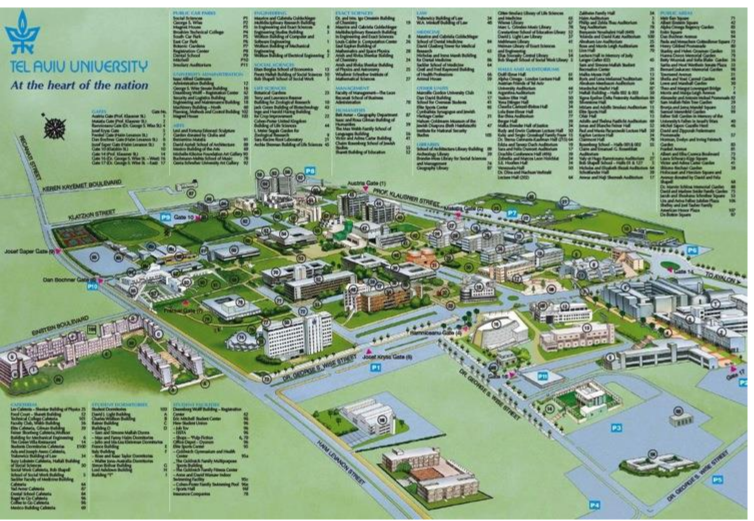
Click <u>here</u> to find the building you are looking for.